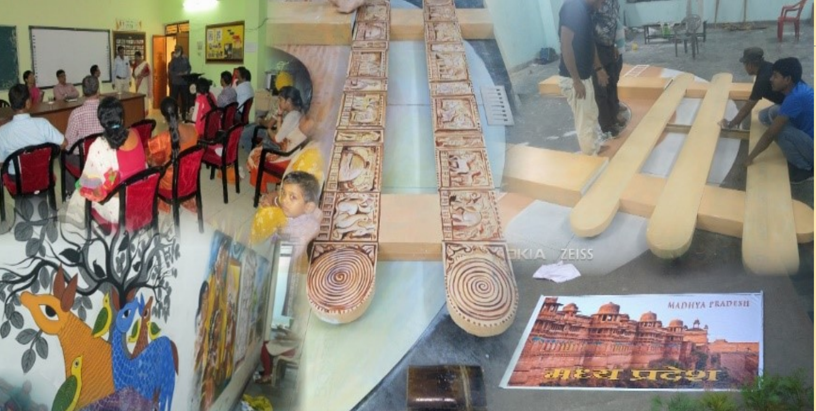
FROM LAYOUT TO DISPLAY: A 10-day workshop and Camp was conducted for Trained Graduate Teachers (Art Education) in which the teachers worked on designing artefacts and building the pavilion for the National Event at India Gate, New Delhi as part of the “Ek Bharat Shrestha Bharat Programme”2019. Selected teachers who participated in the Camp prepared paintings, exhibits and artefacts for the National event.